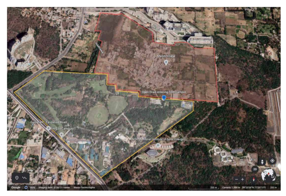
Figure 1 | Satellite imagery showing the location of Mandi village nearby the TERI campus and the open drain entering the TERI campus.

campus comprising of raw sewage, domestic, agricultural and veterinary wastewater. It may be considered as naturally aerated and follows the natural contour and drainage of the area with a horizontal span of 4–6 m within the campus (as shown in Figure 2). From this open drain, a grab sample was collected around Noon on a weekday, the sample was collected from the middle of the flowing stream at about 1.5 m depth with a simple 20 L Polypropylene jar. Water from the polypropylene jar was decanted into two 10 L glass bottles and sealed with a metallic cap ensuring that there was no space for air. Pilot testing on the TADOX<sup>®</sup> plant on the same day and all samples were sent for testing and characterization to an accredited laboratory within 6 h in an ice box maintained at 4 °C.