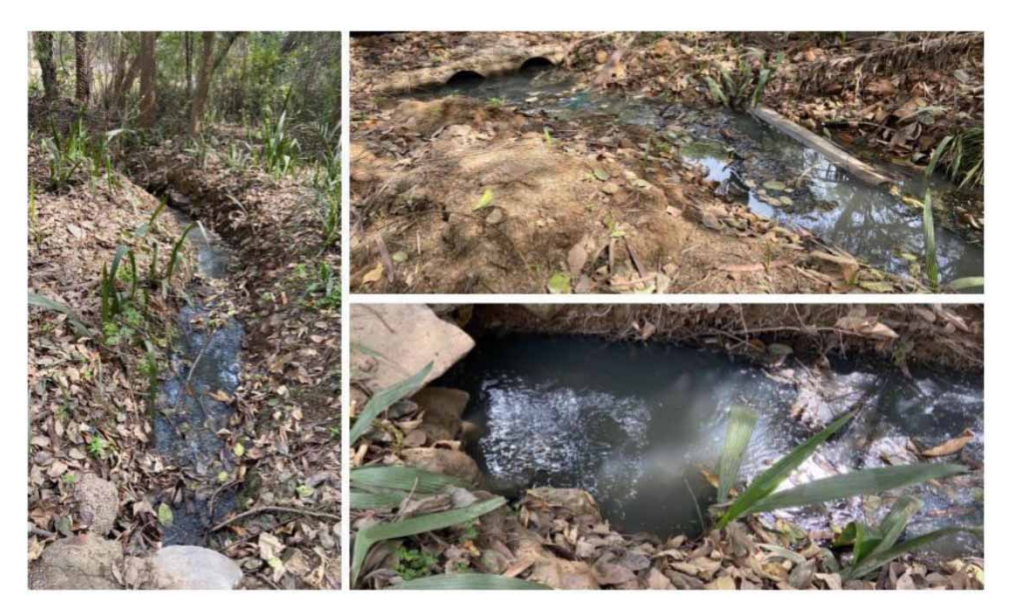
Figure 2 | Photos of the drain flowing through the TERI campus containing untreated sewage from nearby villages.

As shown in Figure 2, the wastewater is slightly discoloured and there is intermittent flow at the point of collection of wastewater. About 5,000 L of sewage flows every day from the village and is only naturally